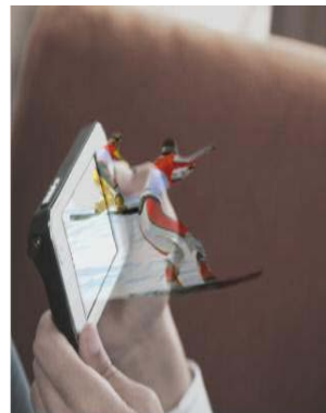
7. Visual Technologies Transform Media & Collaboration