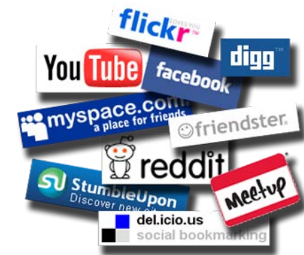
8. Social Media Fundamentally Transform Business