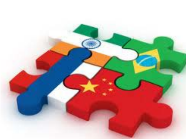
3. Emerging Markets Driving Fundamental Shifts