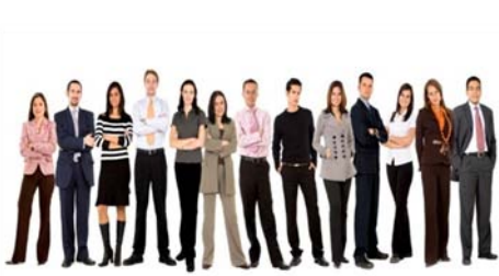
1. Consumer Driven Innovation

Eight trends that will change personal systems over the next 5 years