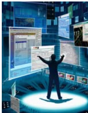
6. Redefinition of Content Experiences