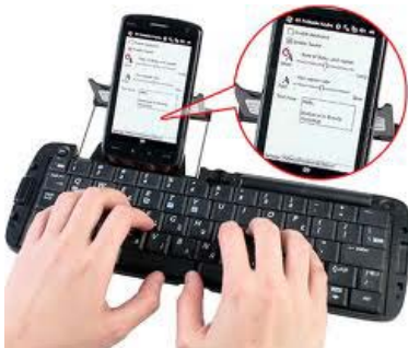
5. Evolution of Personal Computing to New Form Factors