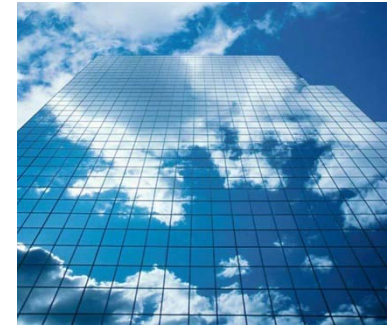
4. Cloud Computing