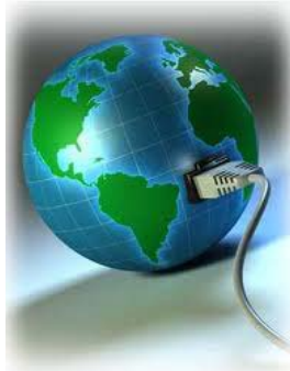
2. Acceleration to a Connected World